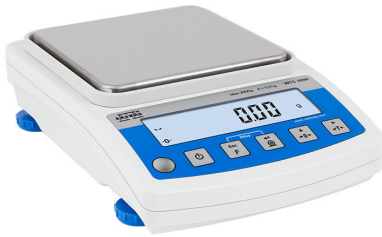
WTC 600 Precision Balance

The drawings, photos and graphics used are for illustrative purposes only.