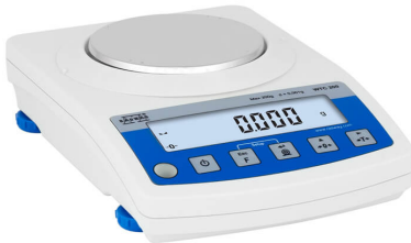
WTC 200 Precision Balance

The drawings, photos and graphics used are for illustrative purposes only.