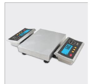
Double sided scale