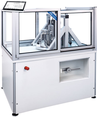
AKM-2.50.5Y Automatic Mass Comparators

The drawings, photos and graphics used are for illustrative purposes only.