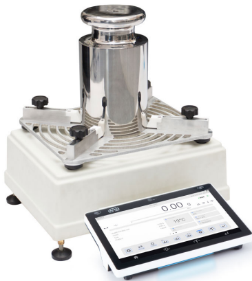
5Y.50.PM.KB Mass Comparator 5Y.25.PM.KB Mass Comparator

More information on the website radwag.com/en/info,w1,Q09